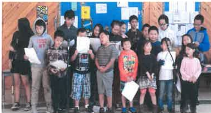
Reading HMong Scriptures and Singing HMong Hymns.