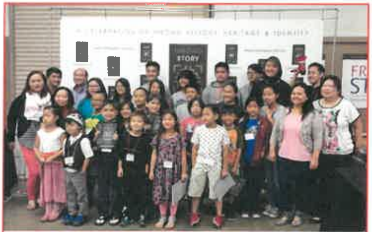
HMong Language School at HMong Story 40 Exhibit

That's what every generation must have finally felt and done in the end.